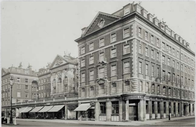
Kensington High Street, 1924