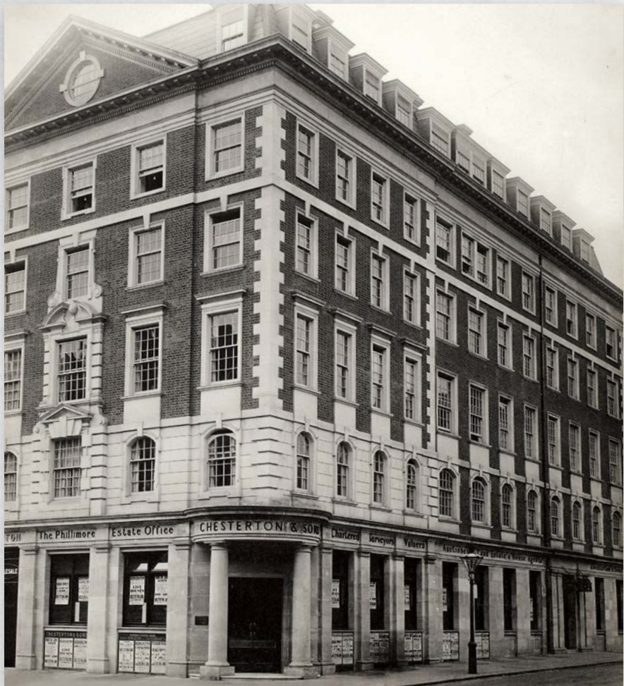
Chesterton & Sons office, Kensington High Street, 1924