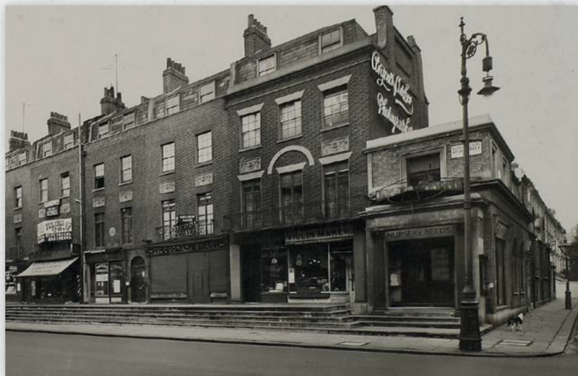
Lower Phillimore Place, 1904